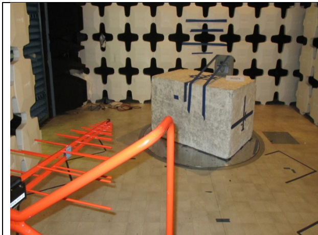
RADIATED FRONT PHOTO (BELOW 1 GHz)