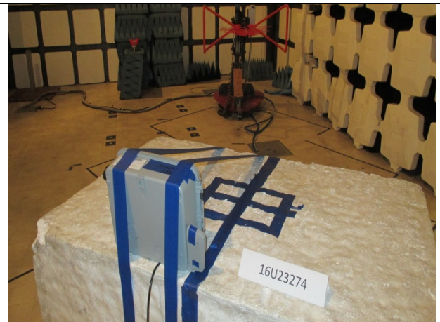
RADIATED BACK PHOTO (BELOW 1 GHz)