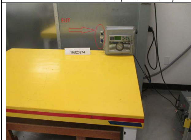
LINE CONDUCTED FRONT PHOTO