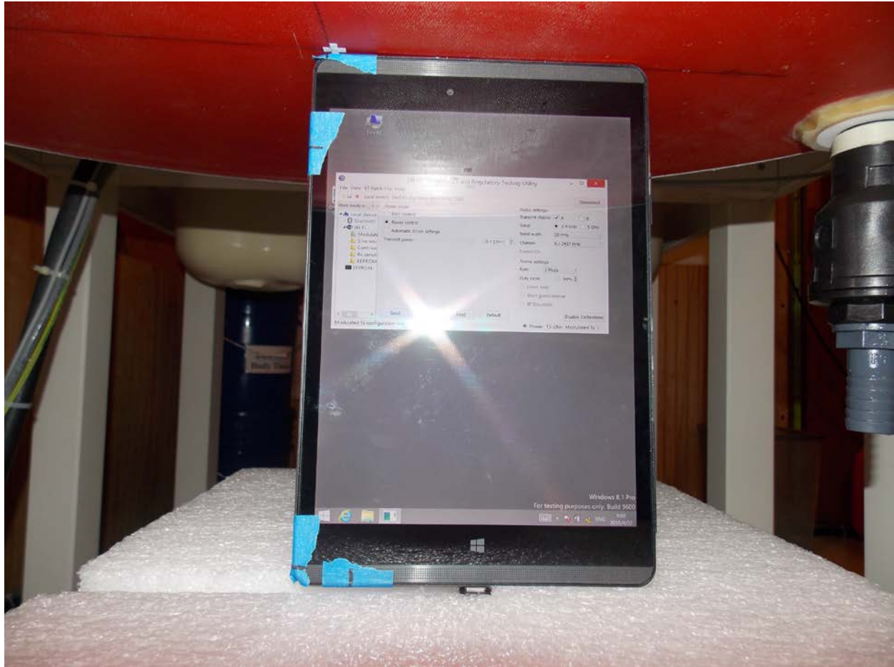
Test Position Top 0 mm Gap