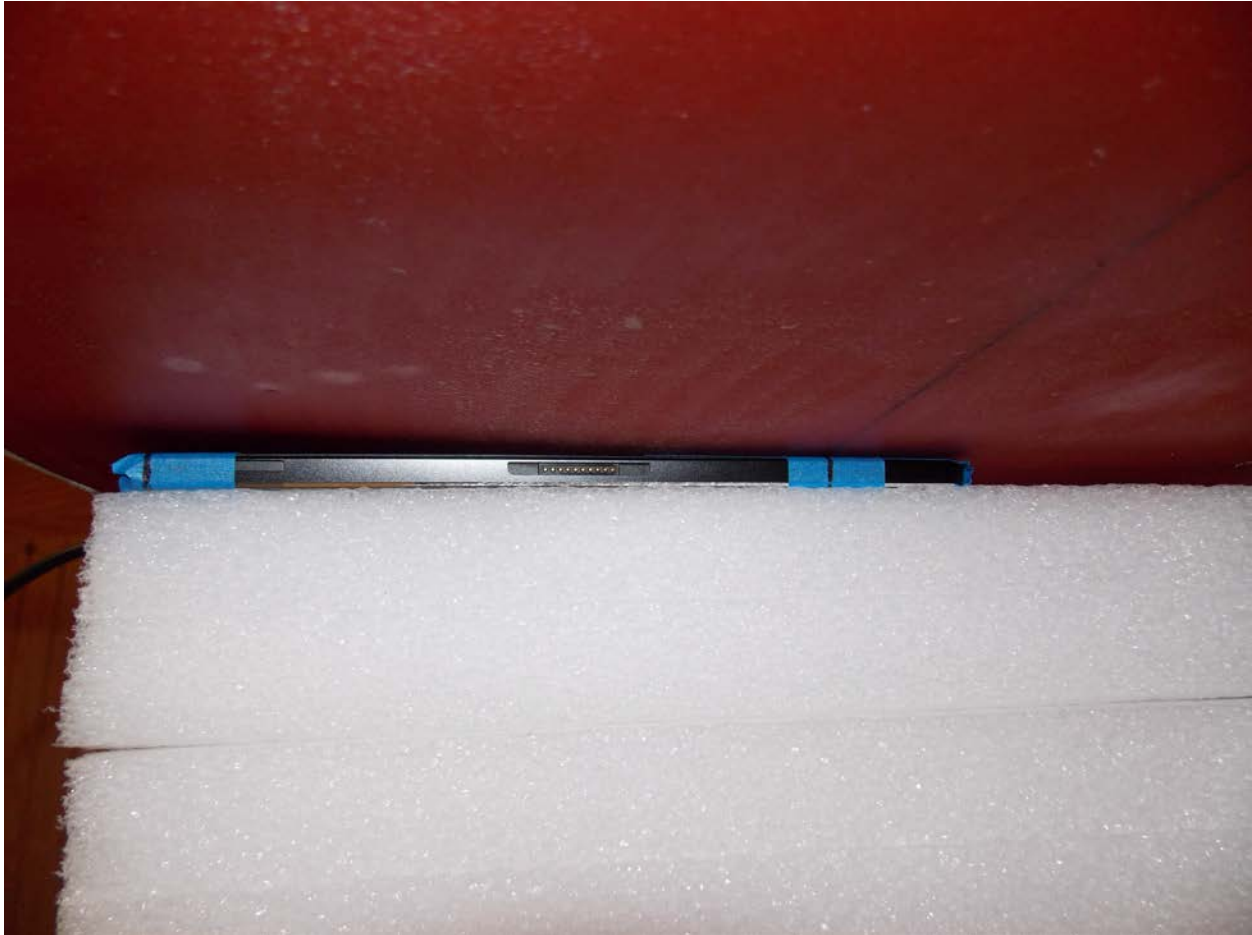
Test Position Back 0 mm Gap