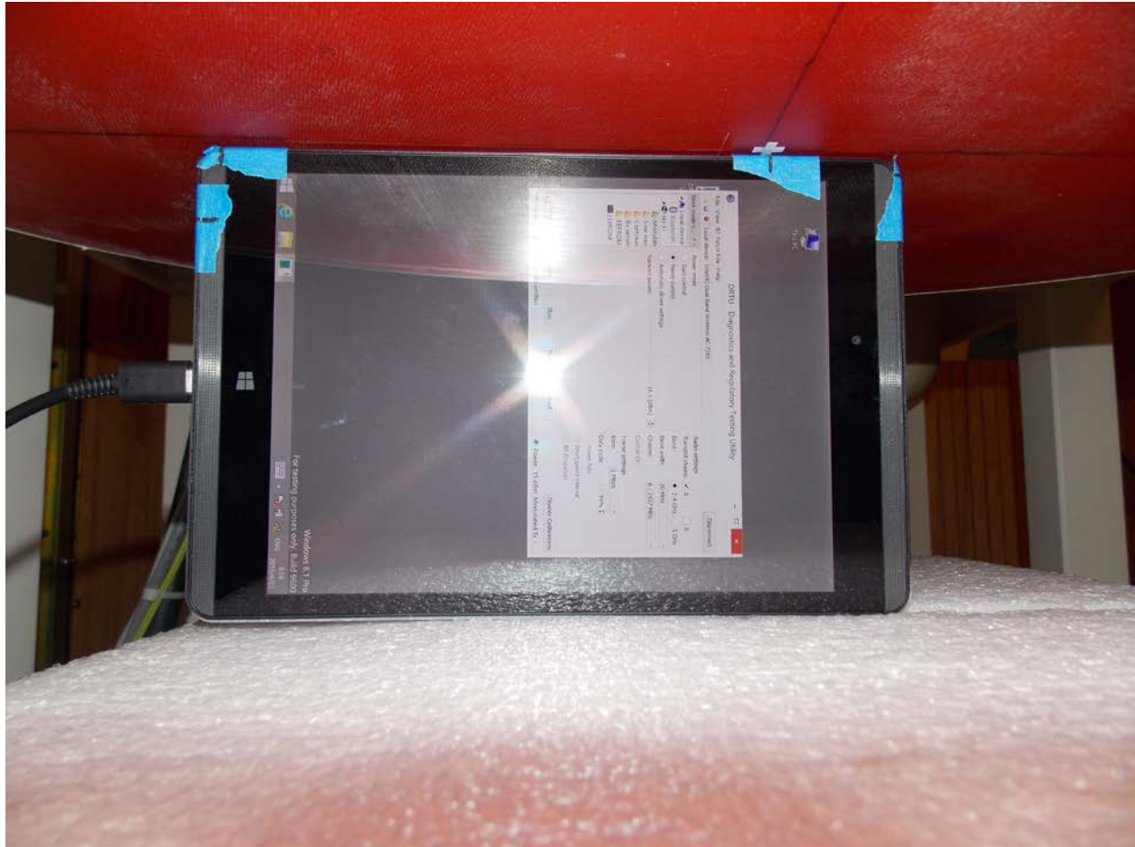
Test Position Left Edge 0 mm Gap