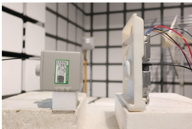
Top Surface at 10 cm separation distance