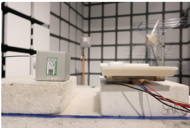
Right Side at 10 cm separation distance