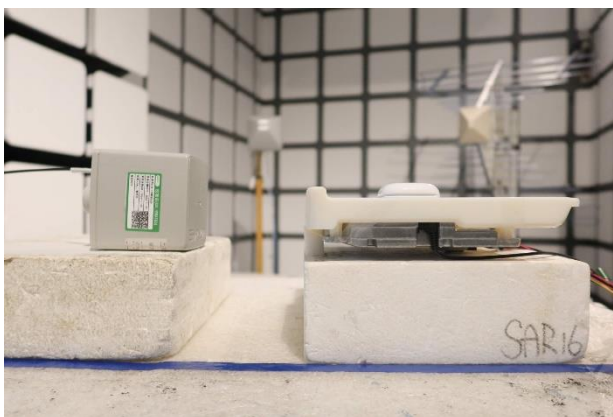
Bottom Side at 10 cm separation distance