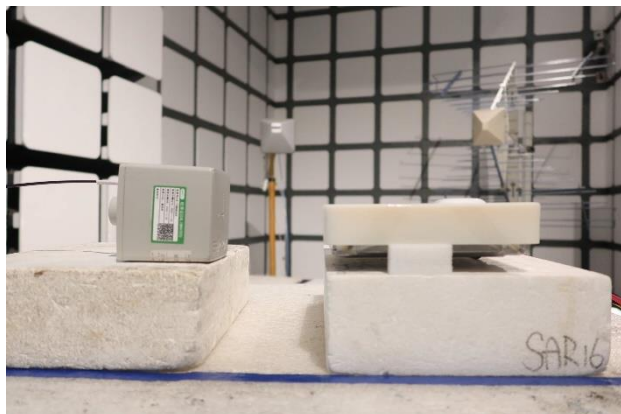
Left Side at 10 cm separation distance

The equipment under test was placed on a desk inside of shield room. The isotropic field probe was used to measure the field strength for 5 EUT surfaces, RF exposure evaluation at 10 cm surrounding the device and 10cm away from the surface, the separation distance is maintained between EUT and the center of the field probe. (The Probe to shell is 8 mm)