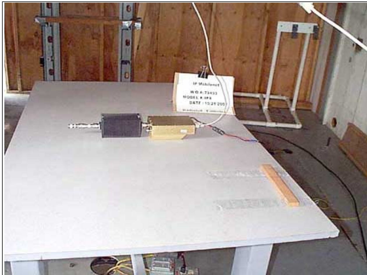
Radiated Emissions - Front View - IP4