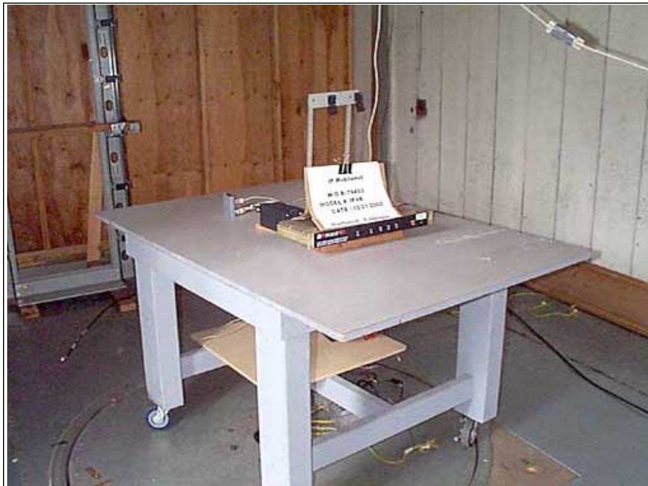
Radiated Emissions - Front View - IP4B