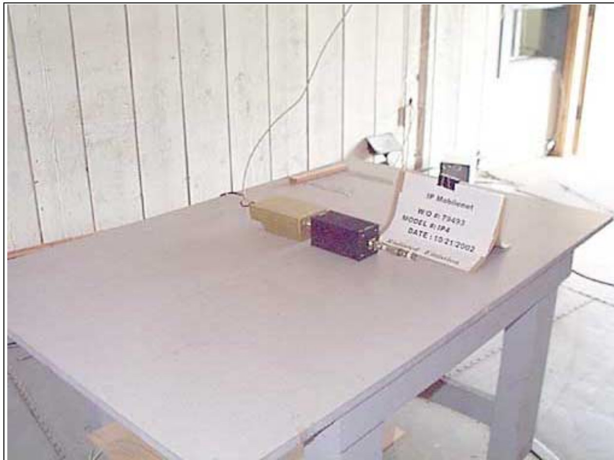
Radiated Emissions - Back View - IP4