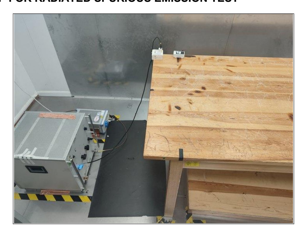
CONDUCTED EMISSION TEST