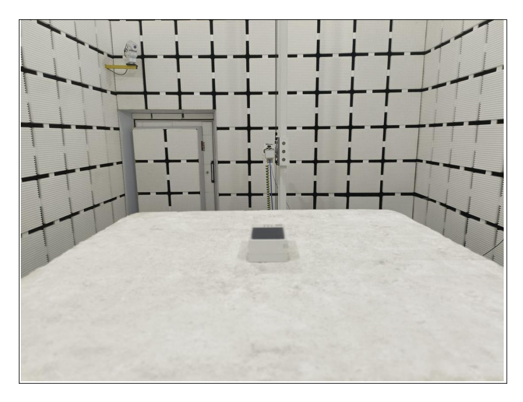
RADIATED EMISSION TEST (18GHz ~ 40GHz)