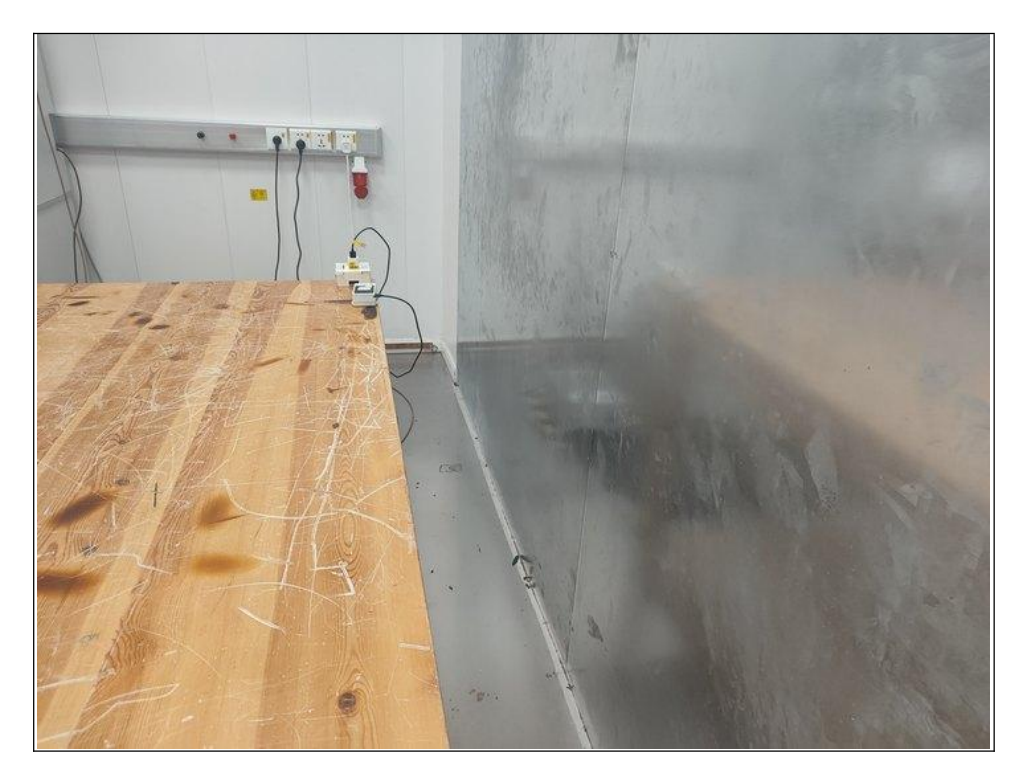
CONDUCTED EMISSION TEST