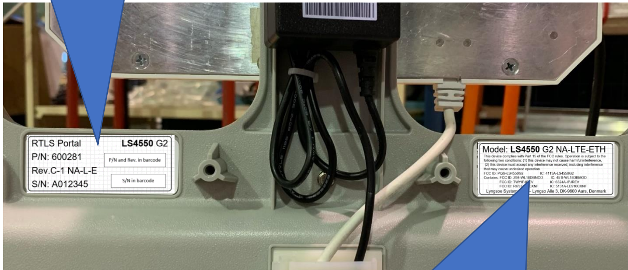
Certifications label for a Quectel or for a Telit LTE modem

This device complies with Part 15 of the FCC rules. Operation is subject to the following two conditions: (1) this device may not cause harmful interference, (2) this device must accept any interference received, including interference that may cause undesired operation.