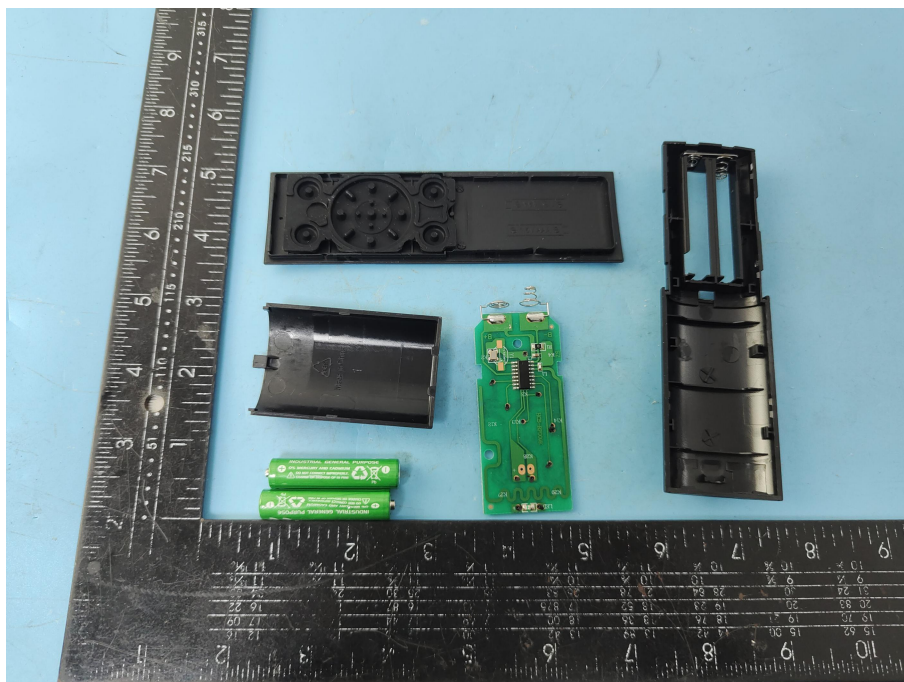
INTERNAL PHOTO OF SAMPLE PCB