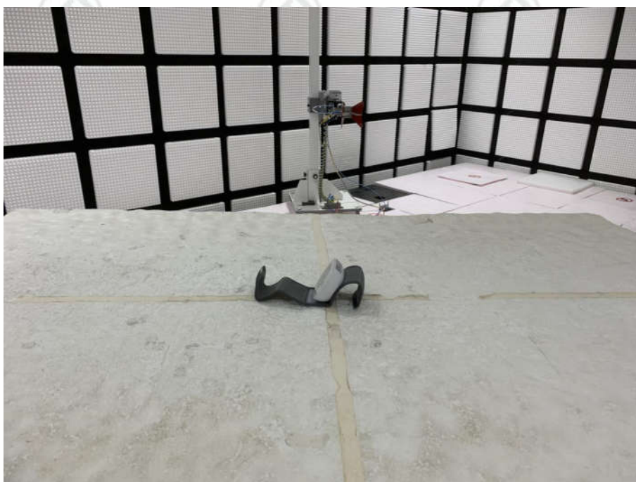
Radiated spurious emission Test Setup-2(Above 1GHz)