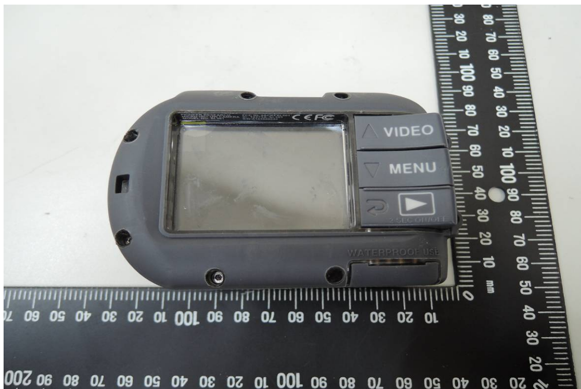
Side View of EUT - 1