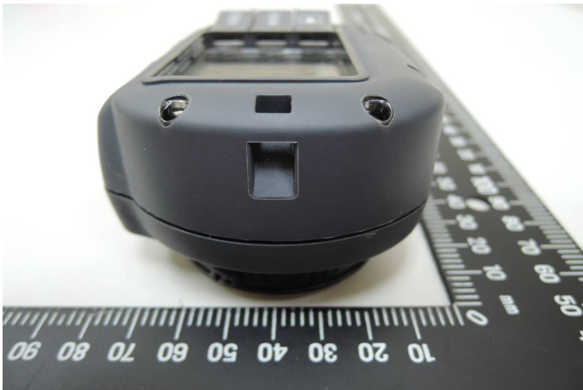
Side View of EUT – 3