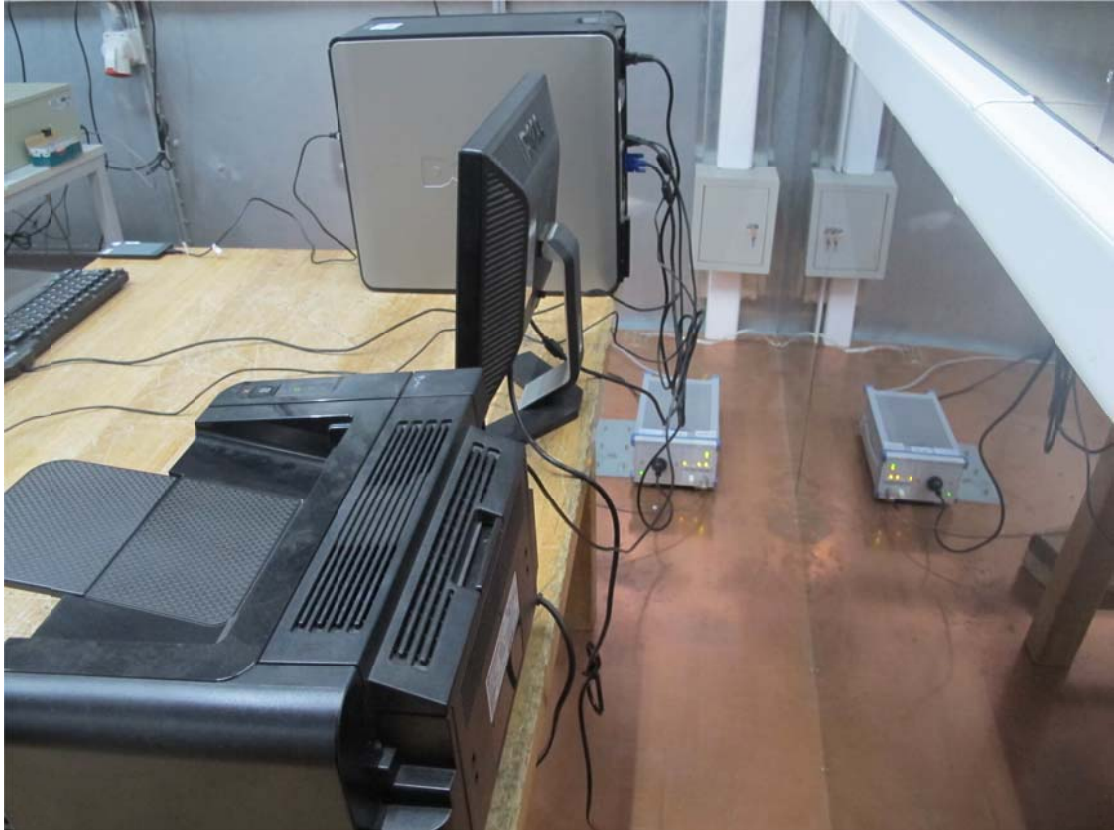
FDD ID RAD533 Conducted emission