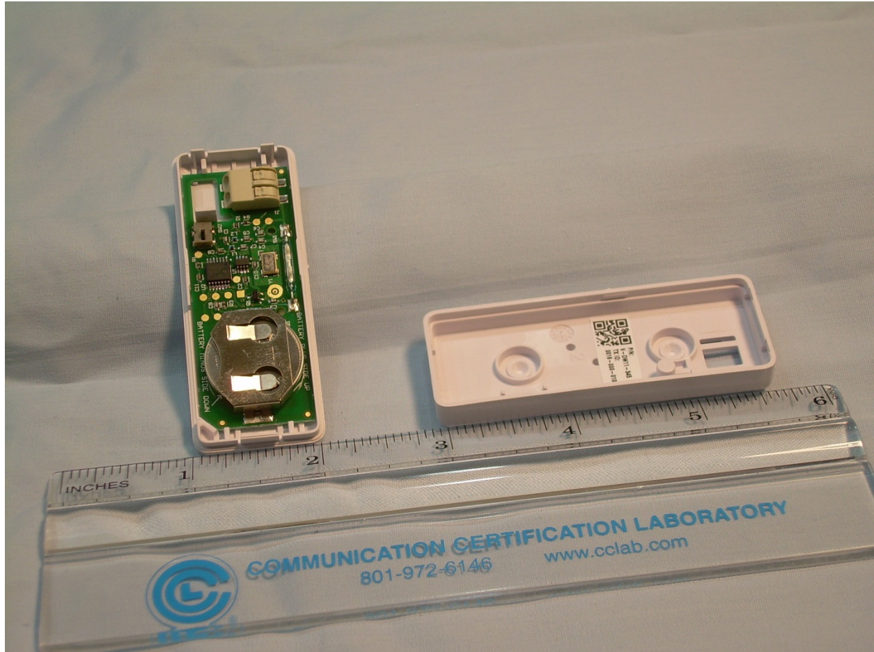
View of the EUT with Housing Opened