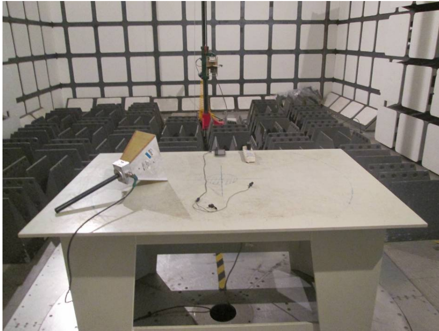
Radiated Emissions –Rear View (Above 1GHz)