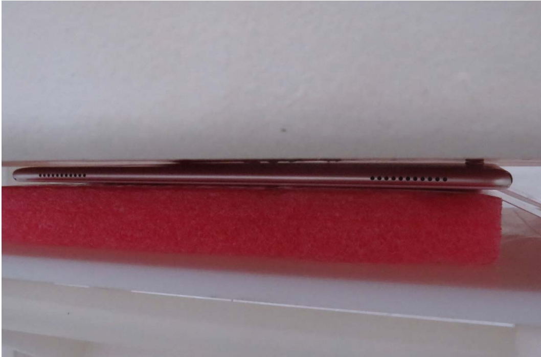
Picture 1: Back Side, the distance from handset to the bottom of the Phantom is 0mm