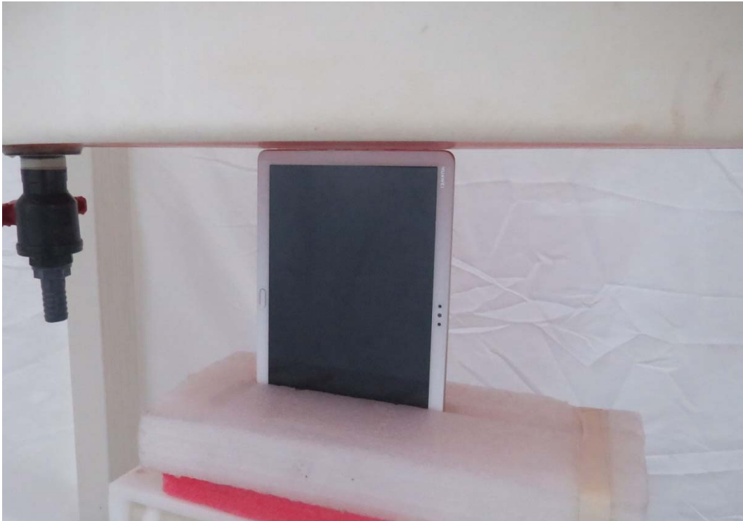
Picture 3: Left Edge, the distance from handset to the bottom of the Phantom is 0mm