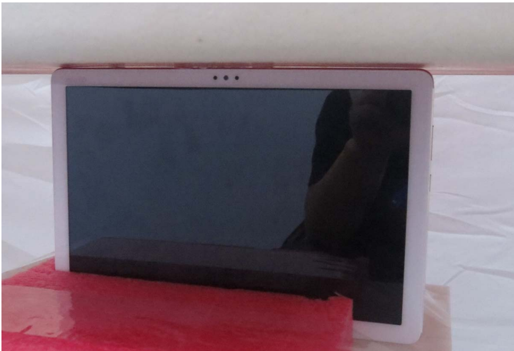
Picture 4: Top Side, the distance from handset to the bottom of the Phantom is 0mm