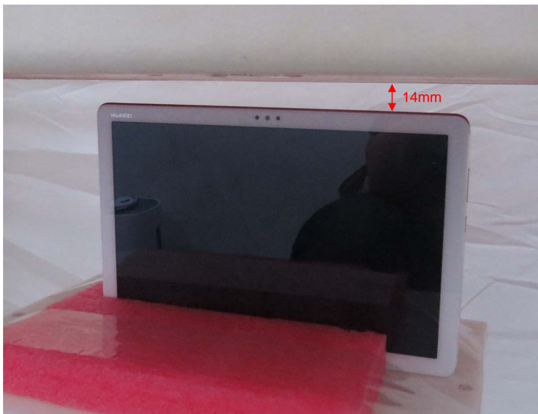
Picture 5: Top Side, the distance from handset to the bottom of the Phantom is 14mm