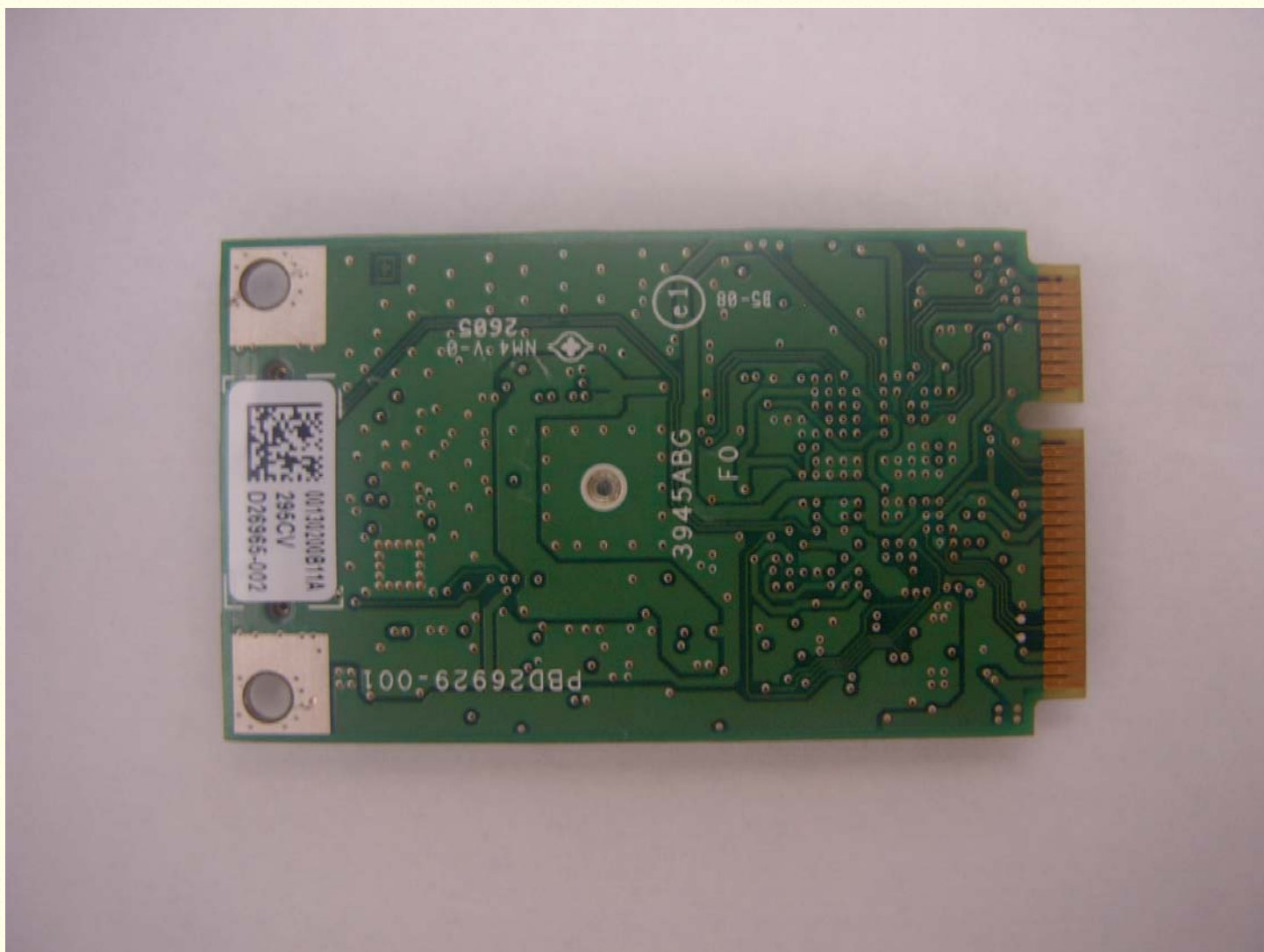
Bottom View “Insulation removed”