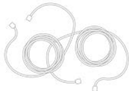
CAT5 Ethernet Cables