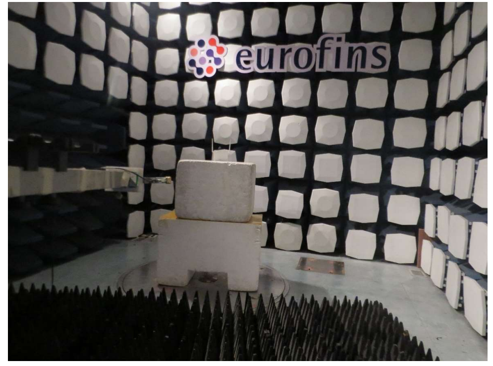
26.5GHz -40GHz Picture 1 Radiated Emission Test Setup