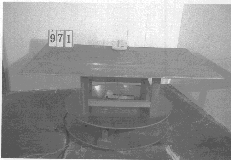
Pig 1 Front View of the Test Configuration ( BASE )