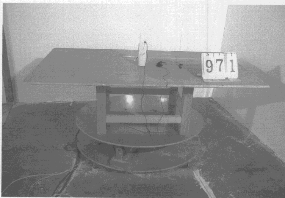
Pig 2 Rear View of the Test Configuration (HANDSET)

The test configuration for frequency between 1 GHz to 18 GHz is same as above.