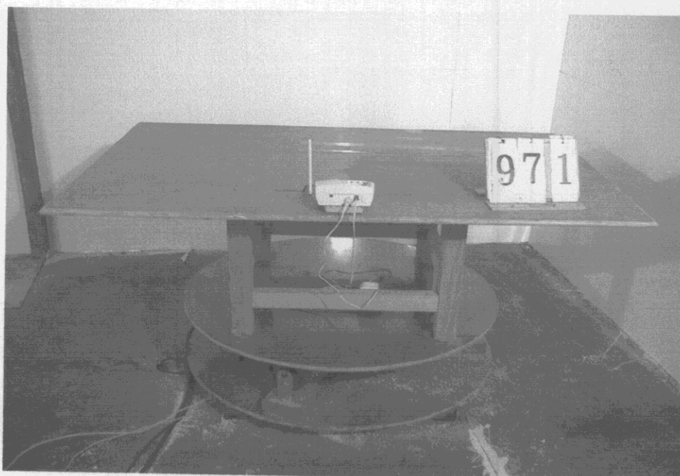
Pig 2 Rear View of the Test Configuration ( BASE )