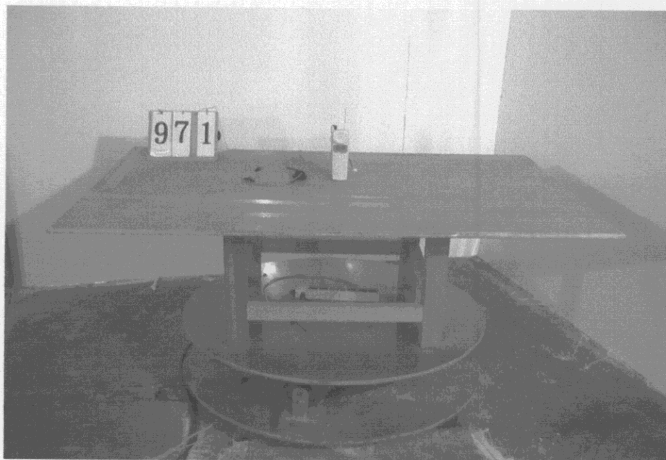
Pig 1 Front View of the Test Configuration (HANDSET)