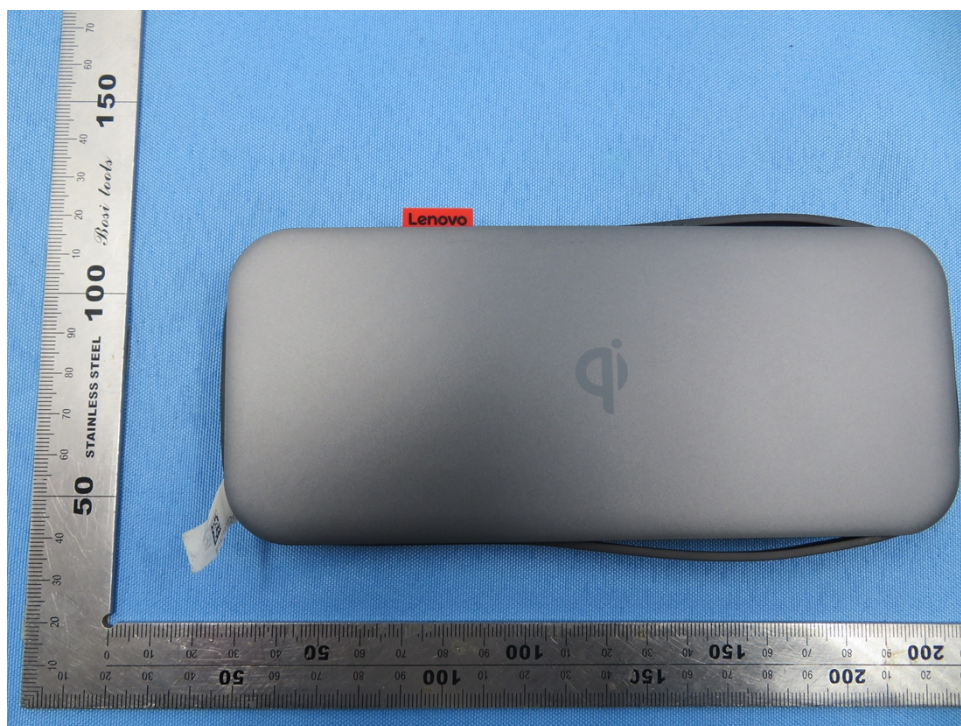
Picture 1. Front view of Power Bank