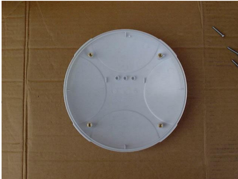
Figure 1 Front Cover Internal View