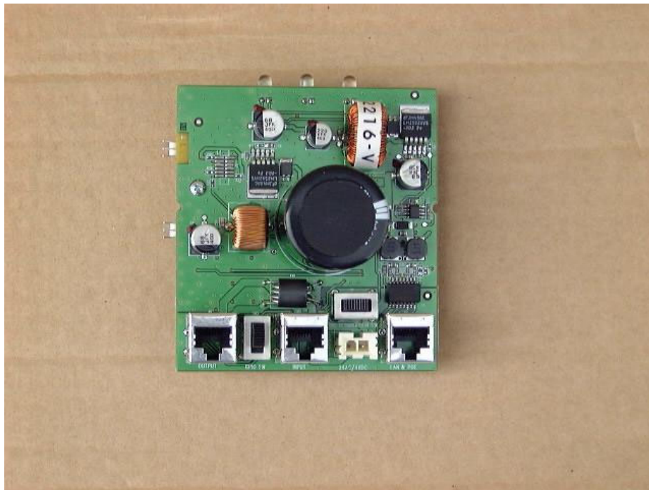
Figure 5 PCB 1 Side 2