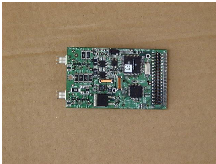
Figure 7 PCB 2 Side 2