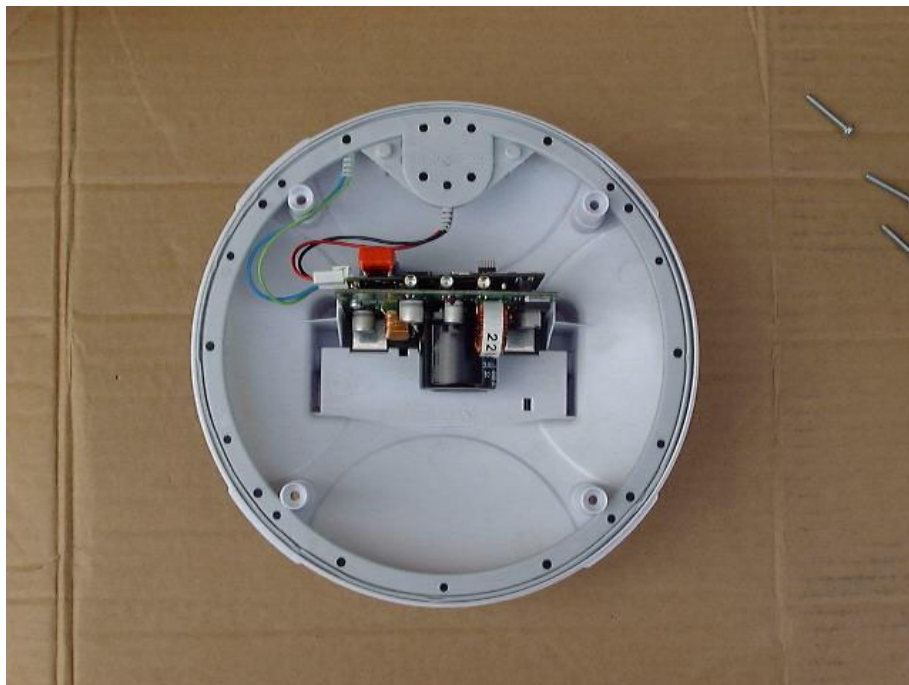
Figure 2 Rear Cover Internal View With Transmitter