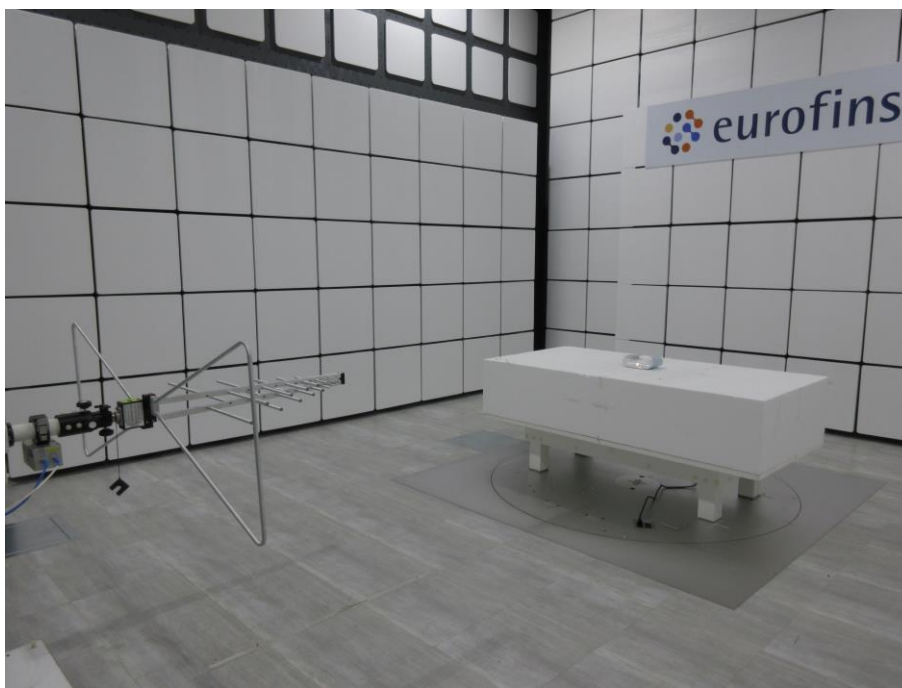
Below 1 GHz _ Rear View