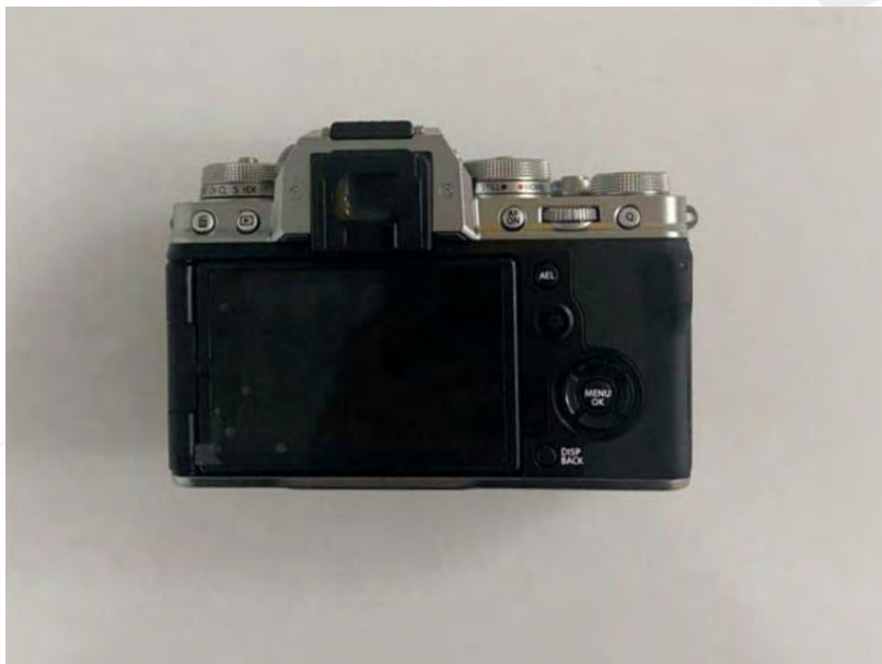
Fig.8 Back view of EUT

Unless otherwise stated the results shown in this test report refer only to the sample(s) tested and such sample(s) are retained for 90 days only. 除非另有說明，此報告結果僅對測試之樣品負責，同時此樣品僅保留90天。本報告未經本公司書面許可，不可部份複製。