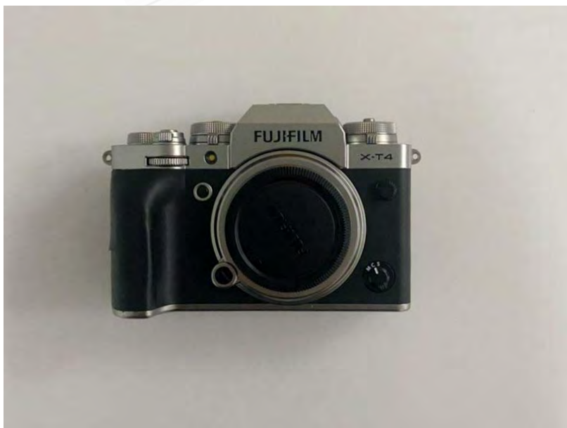
Fig.7 Front view of EUT