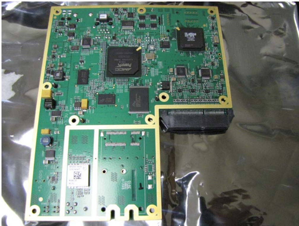
Main Board backside.