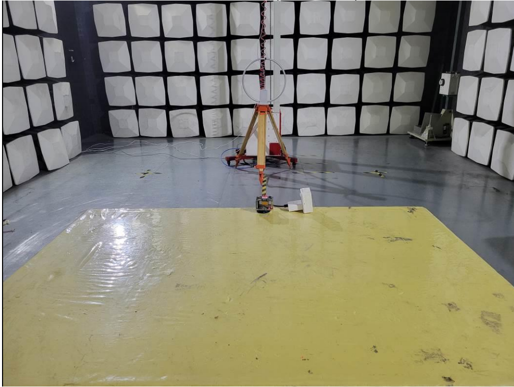
Test Photo Radiated emission (Below 30MHz)