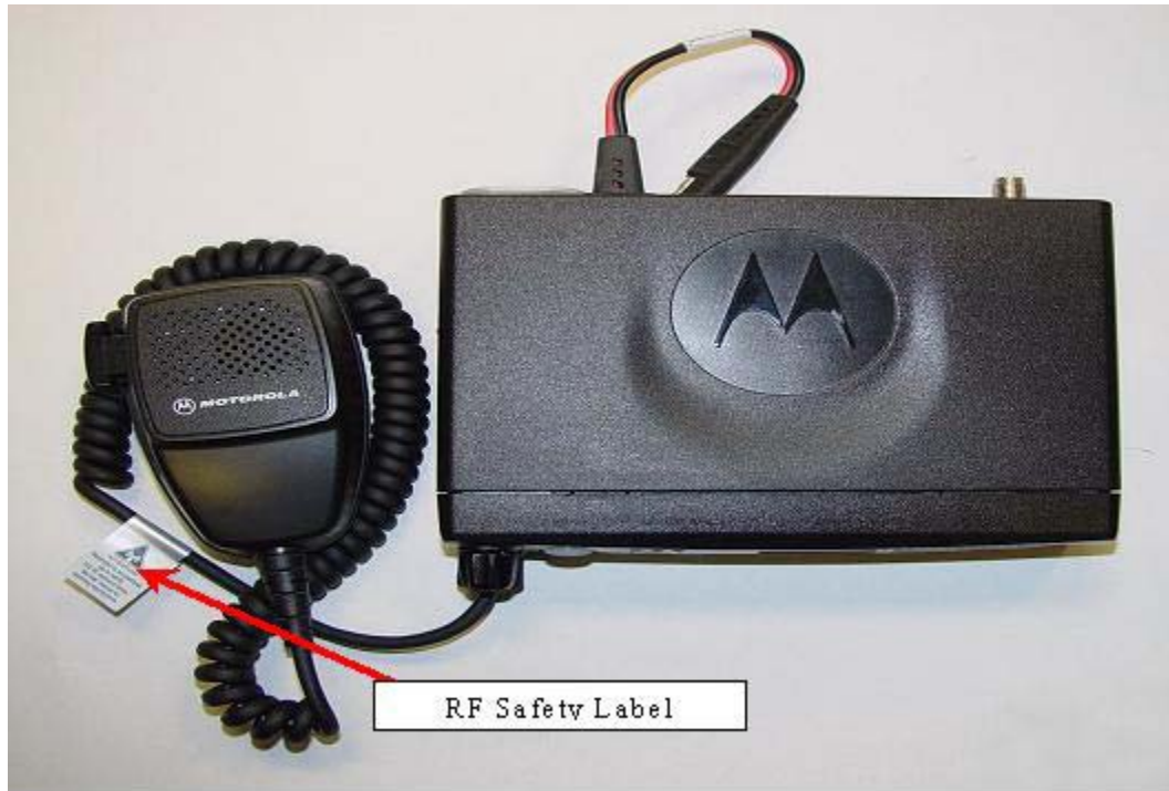
Figure 3-7: View of RF Safety Label attached to microphone cord