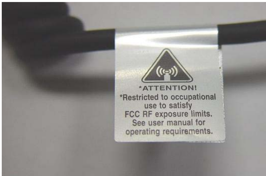
Figure 3-8: Close-Up of RF Safety Label