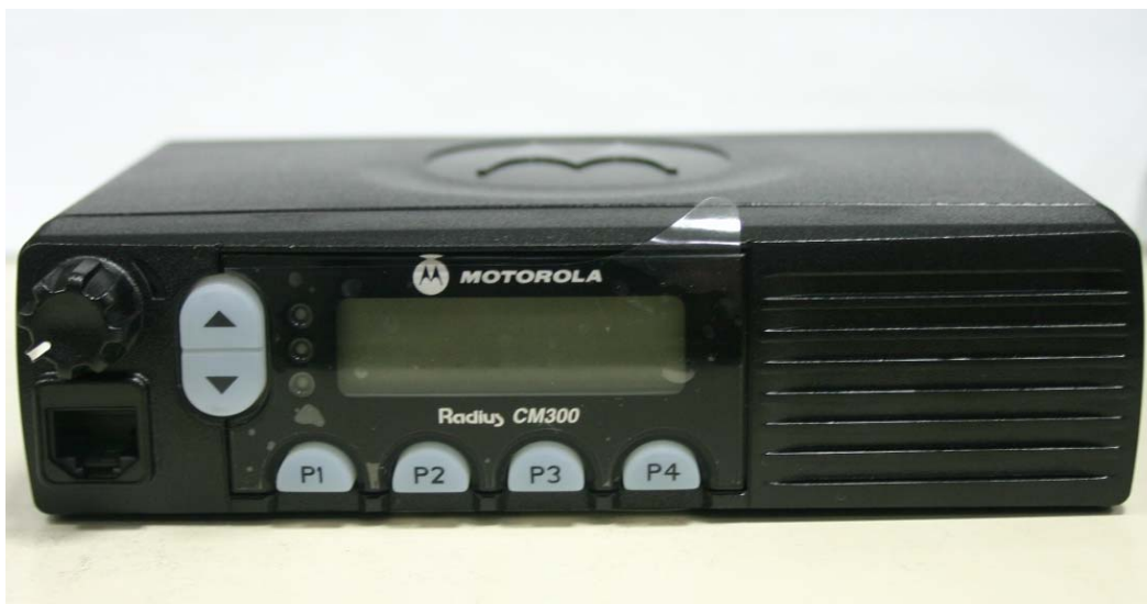
Figure 3-2: Front View, CM300 Model