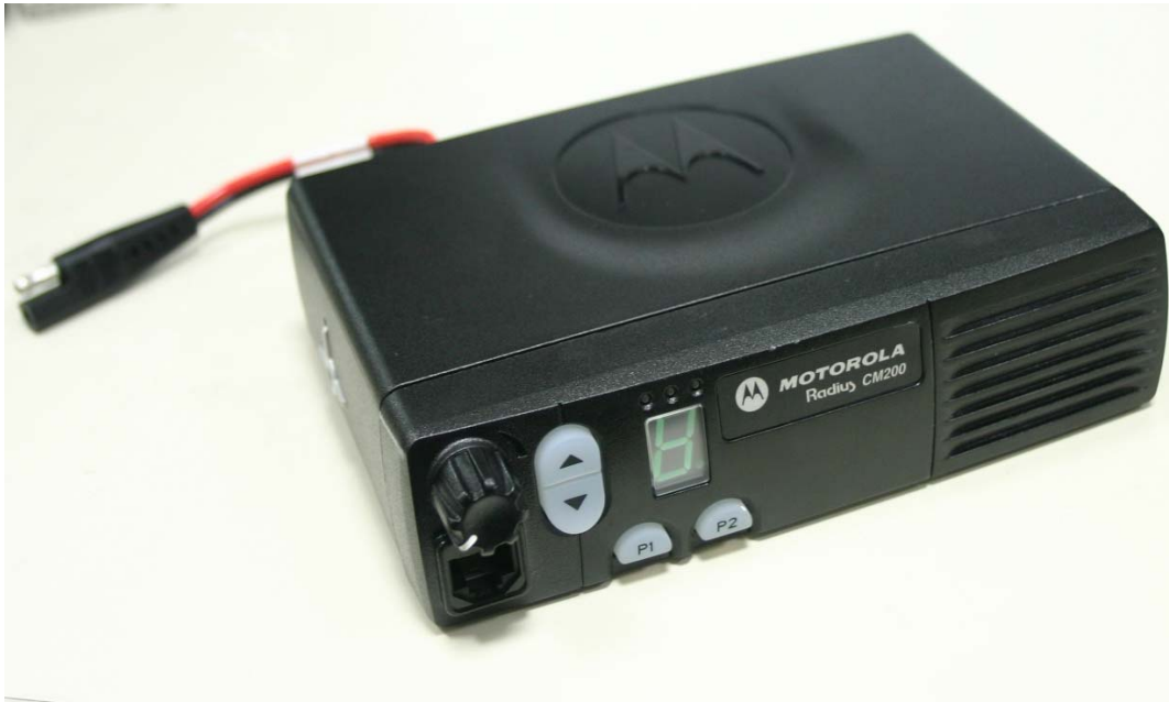
Figure 3-3: General View, CM200 Model