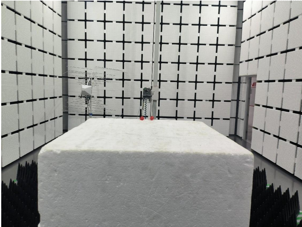
AC Conducted Emission