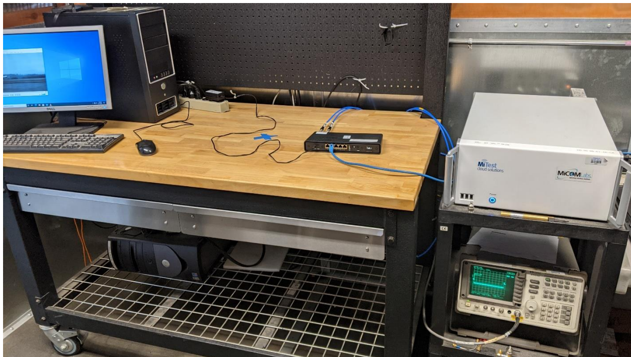
DFS Conducted Test Setup