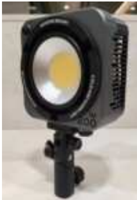
ZHIYUN MOLUS G200 x1

Before using this product, please check carefully that all the following items are included in the product package. In case that any item is found missing, please contact ZHIYUN or your local selling agent.