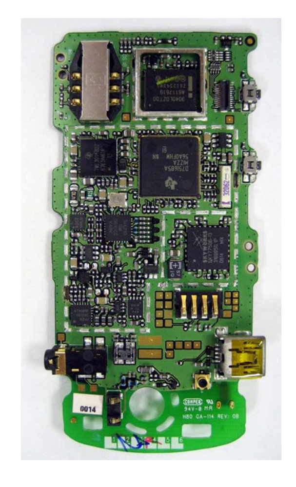
Main Board Bottom With Shields