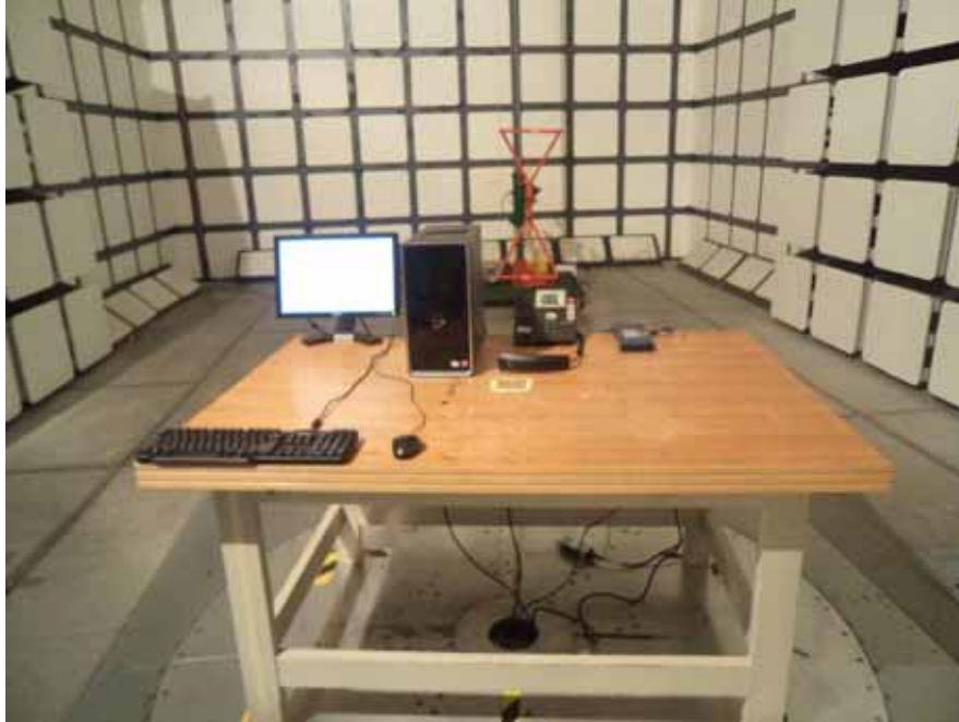
Radiated Emissions – Rear View (Below 1 GHz, for PoE)