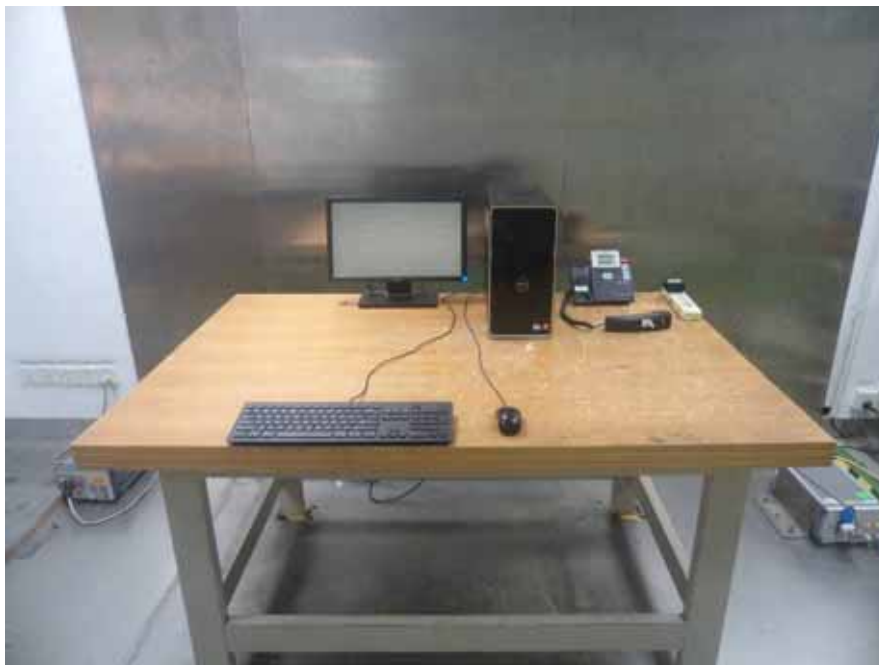
Conducted Emissions - Side View (for adapter 2)