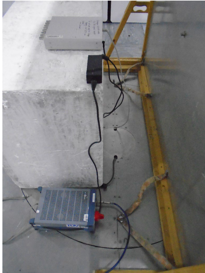
Figure 1 – Conducted Disturbance at Mains Terminals