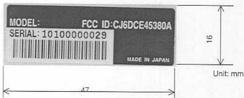
FCC ID Nameplate

A Nameplate of this type or one similar to this will be affixed to every Transceiver.