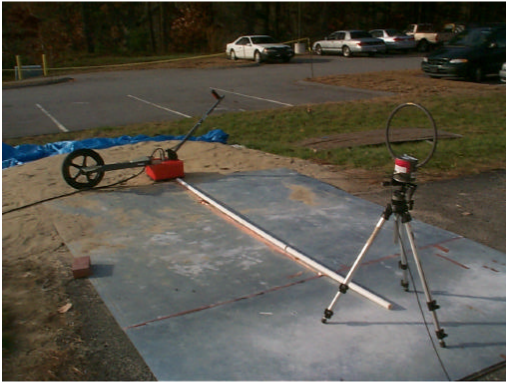
Model 5103 – worst case setup for measurements < 26\text{MHz}