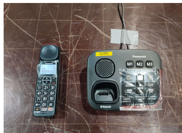
Radiated Emissions 30 – 1000 MHz