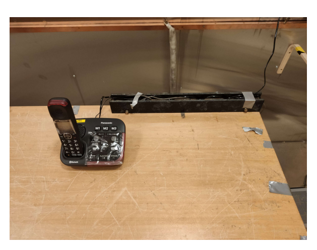
Power-Line Conducted Emissions