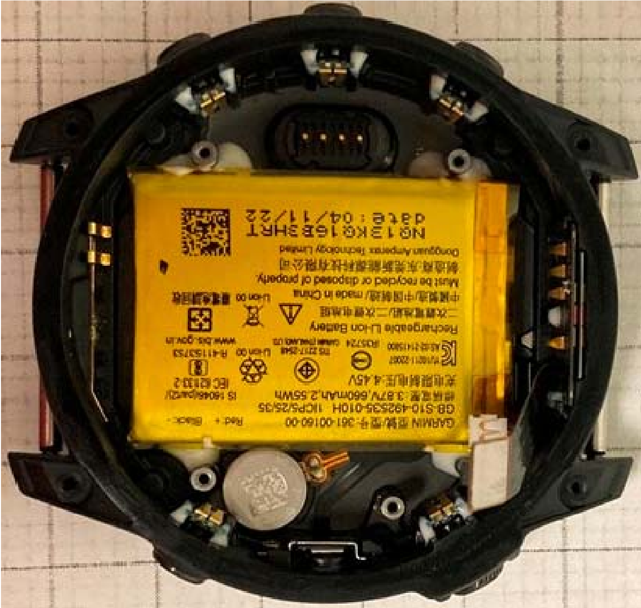
Figure E15.1 – Internal, Back Cover Removed