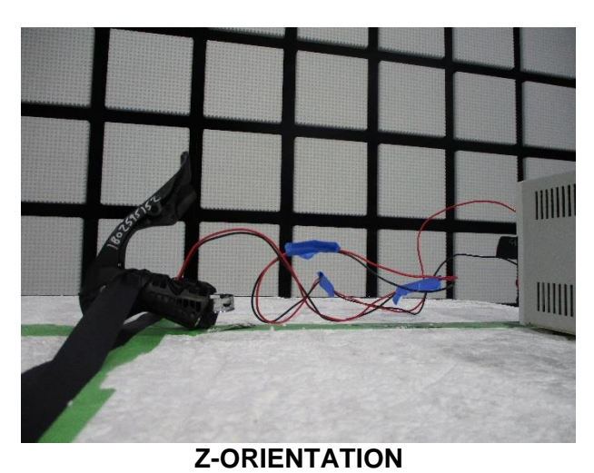
END OF TEST REPORT