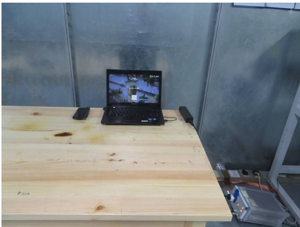
Conducted Emission-PC charge mode