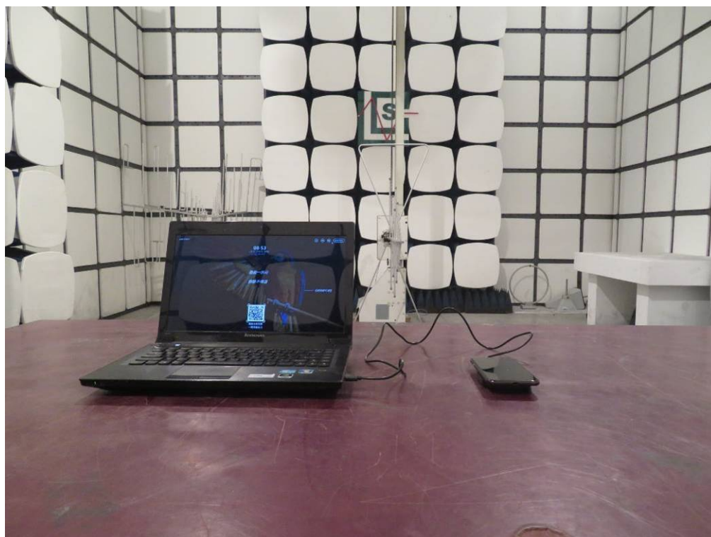
Radiated Emission below 1GHz-PC charge mode