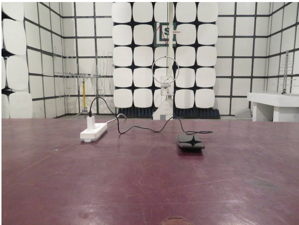
Radiated Emission below 30MHz-AC adapter charge mode