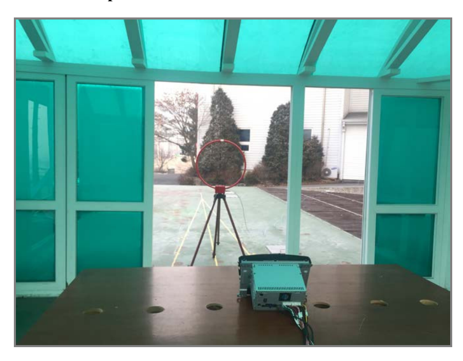
Photo of radiated spurious emission at 30 \mathrm{MHz} \sim 1~000 \mathrm{MHz}

Photo of radiated spurious emission at below 30MHz