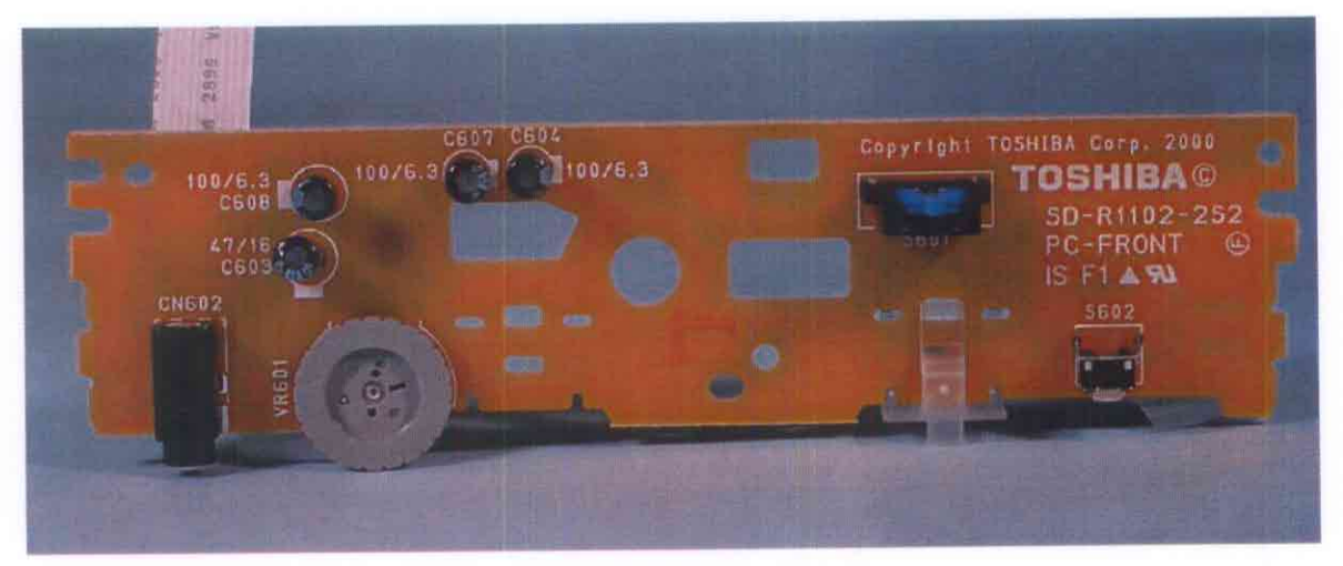
Front PWB Surface Location