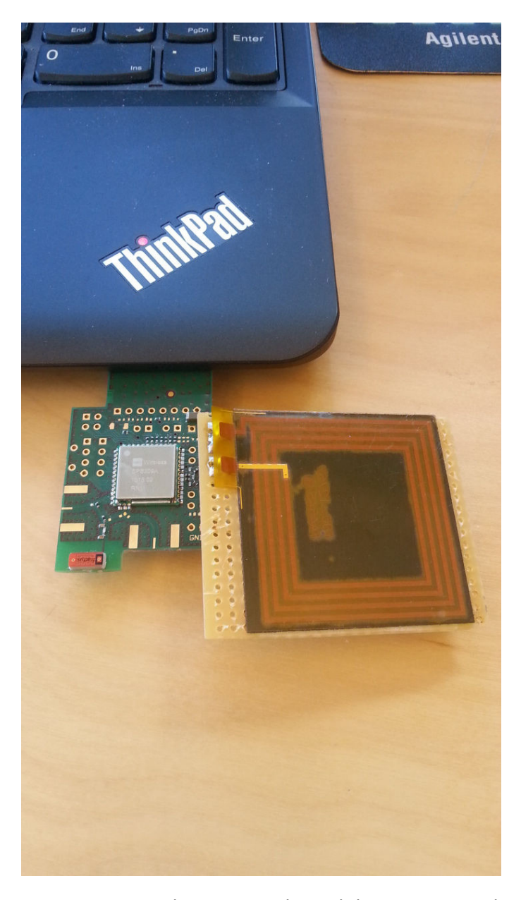
Figure 3, SD-card SPB111 with module SPB209A and a NFC antenna connected to the SD-slot of a laptop.