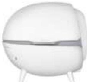
Automatic cat litter box

The picture is for reference only, please refer to the actual product!.