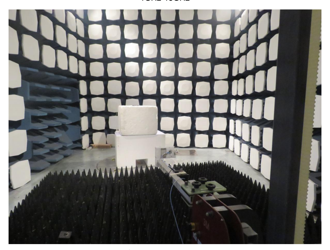
18GHz - 26.5GHz