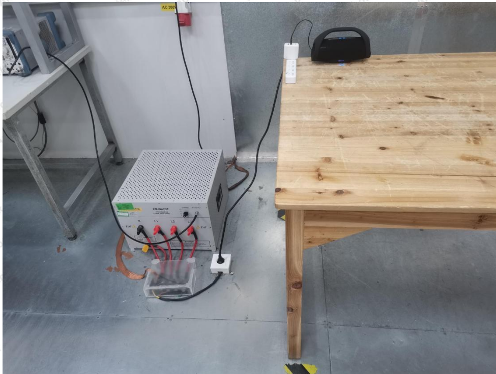
Photo of Radiation Emission Test