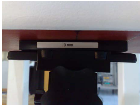
Photo of the device positioned for WR mode measurement –back facing phantom. The spacer was removed before the start of the measurements.

The device was placed in the SPEAG holder using the Microsoft spacer and, in sequence, the back, display and each of the 4 edges was positioned 10 mm away from the flat phantom. The spacer was removed before the start of the measurements.