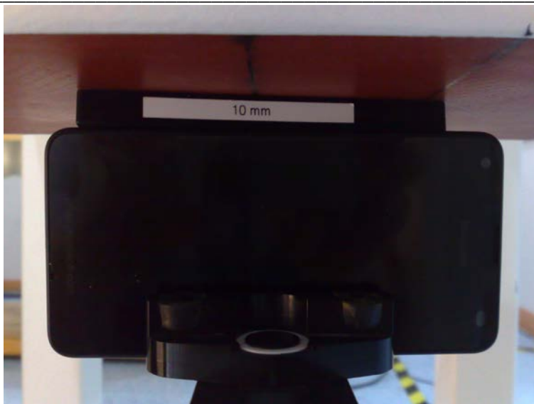
Photo of the device positioned for WR mode measurement – left edge facing phantom. The spacer was removed before the start of the measurements.