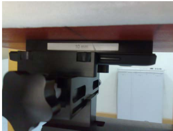
Photo of the device positioned for WR mode measurement – display facing phantom. The spacer was removed before the start of the measurements.