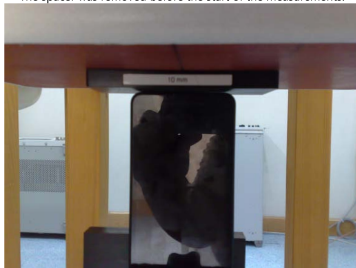
Photo of the device positioned for WR mode measurement – bottom edge facing phantom. The spacer was removed before the start of the measurements.