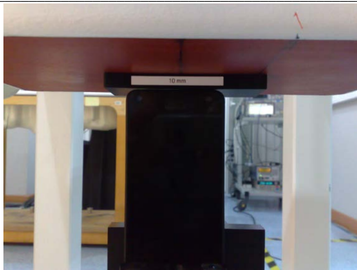
Photo of the device positioned for WR mode measurement – top edge facing phantom. The spacer was removed before the start of the measurements.