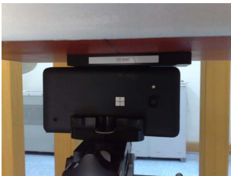
Photo of the device positioned for WR mode measurement – right edge facing phantom. The spacer was removed before the start of the measurements