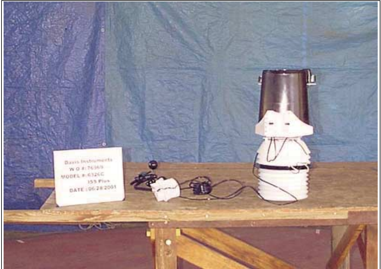
Radiated Emissions - Front View