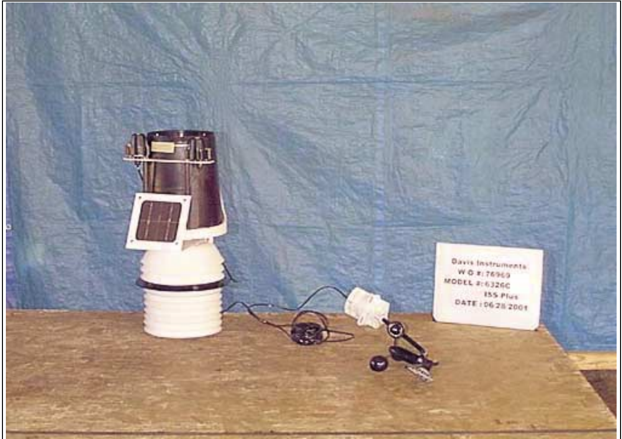
Radiated Emissions - Back View