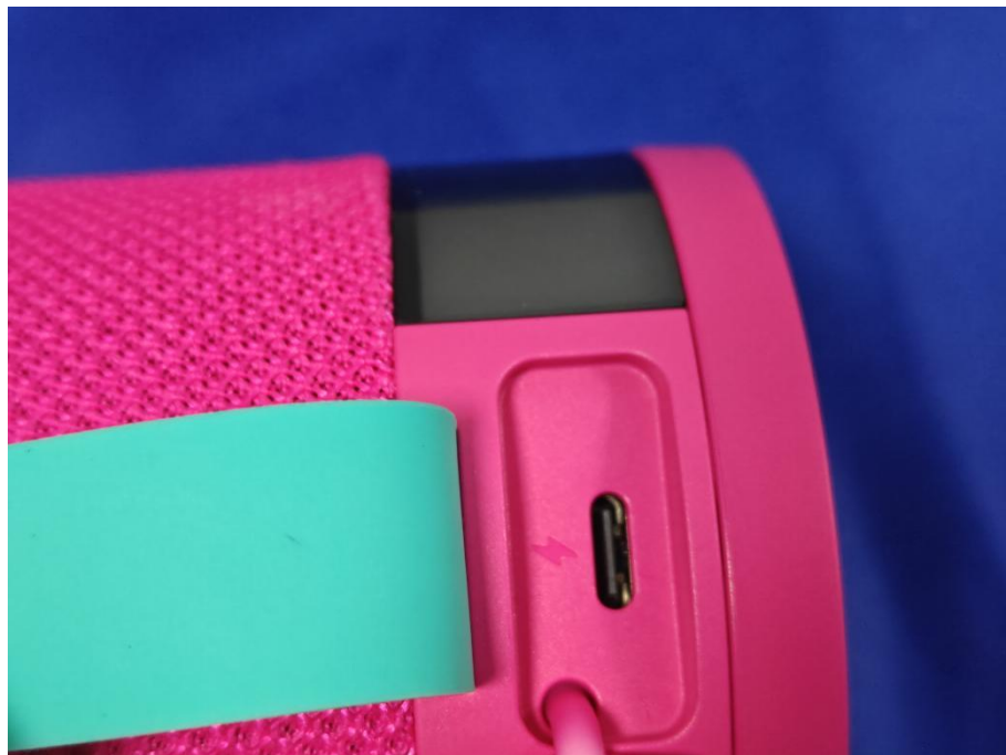
View of Product-8