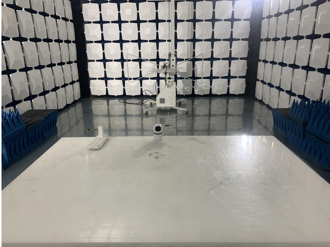
Above 1GHz for radiated emission test setup