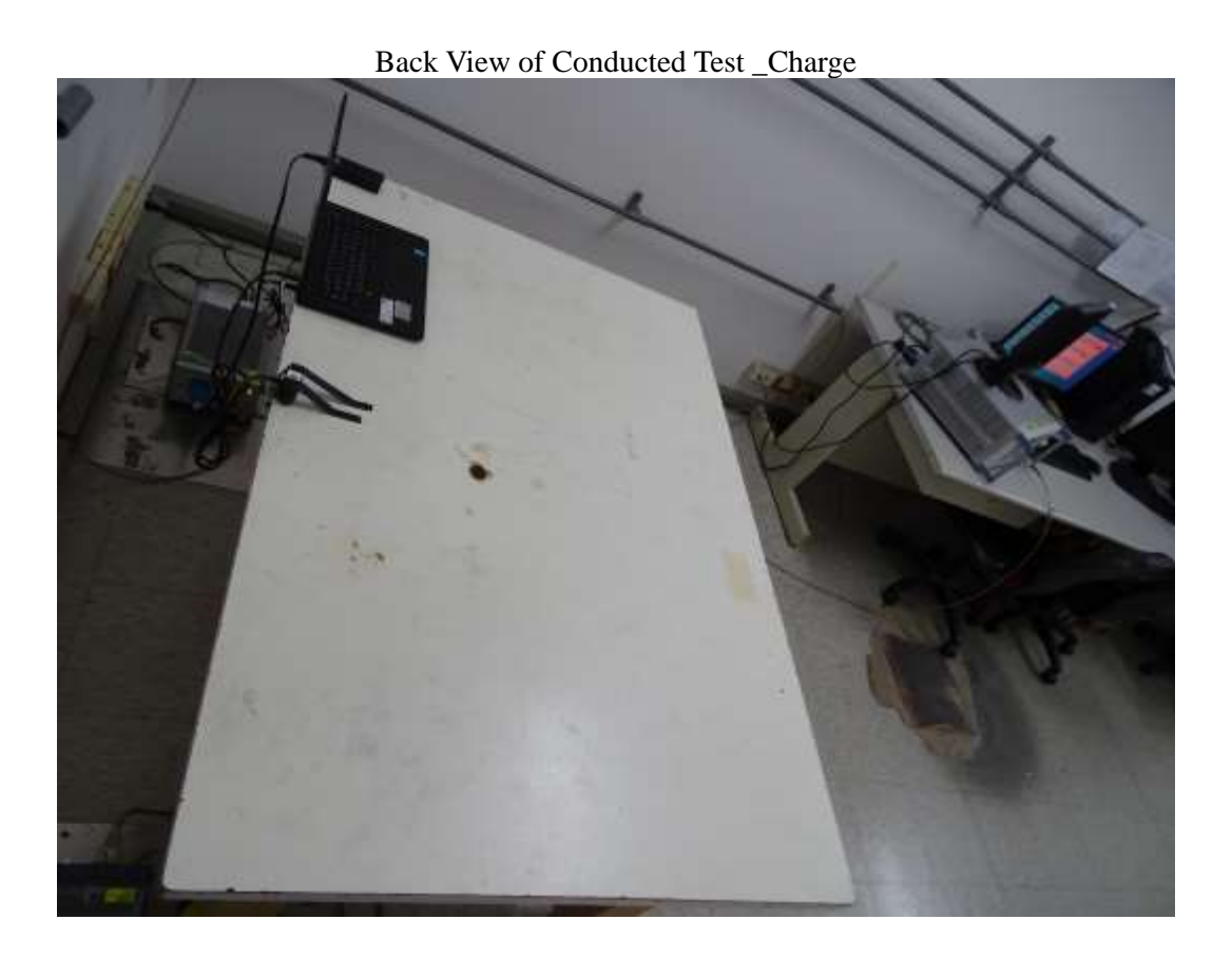
Page : 1 of 3