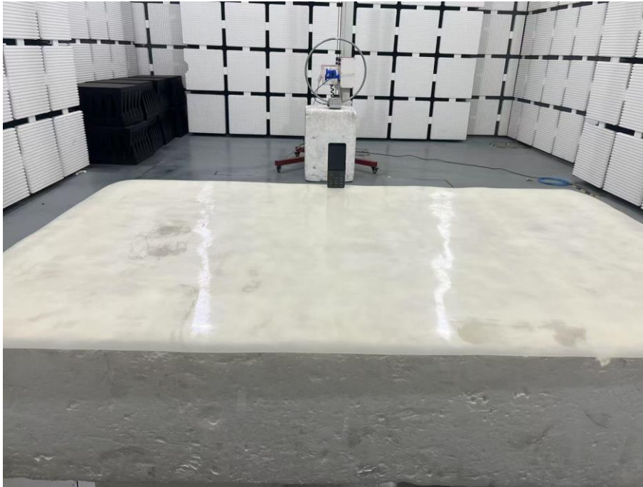
Set-up for Transmitter & Receiver Spurious Emissions, 30MHz to 1000MHz