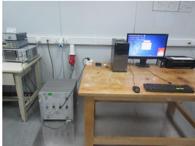
Radiated Emission (30MHz-1GHz) Connect to PC