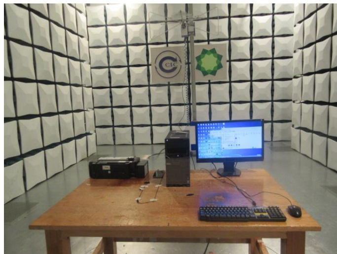
Radiated Emission (above 1GHz) Connect to PC