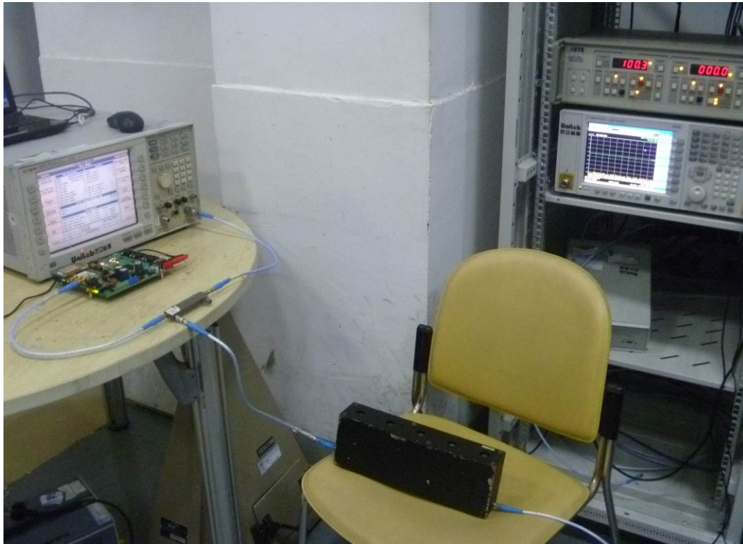
Frequency Stability Under Temperature & Voltage Variations Setup